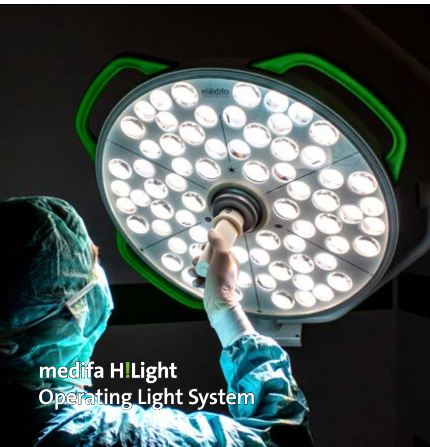
medifa H!Light Operating Light System