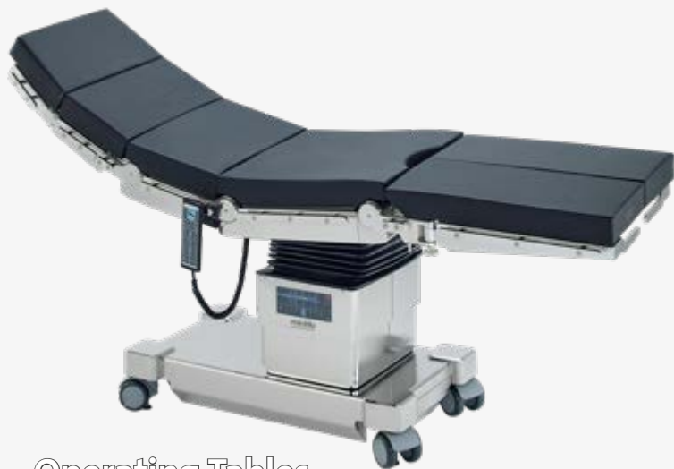
Operating Tables and Accessories