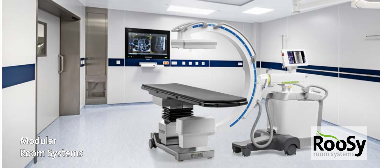
Modular Room Systems