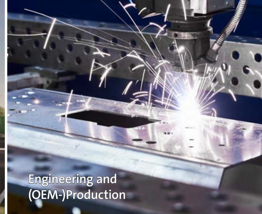
Engineering and (OEM-)Production

The slogan „we care“ means for us that we consistently orientate ourselves according to the requirements of our customers. Customers all over the world can rely on top-class consultation, processing and quality from a single source, made in Germany according to certified national and international quality standards.